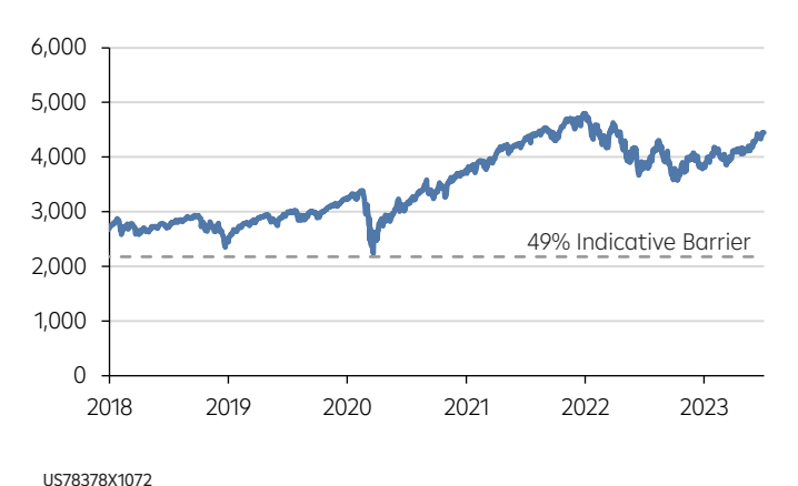
As of July 5, 2023; Source: Bloomberg (SX5E Index, SPX Index); Please note that past performance is no reliable indicator for future performance of this underlying.