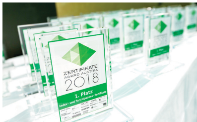
The Certificate Awards Austria 2018