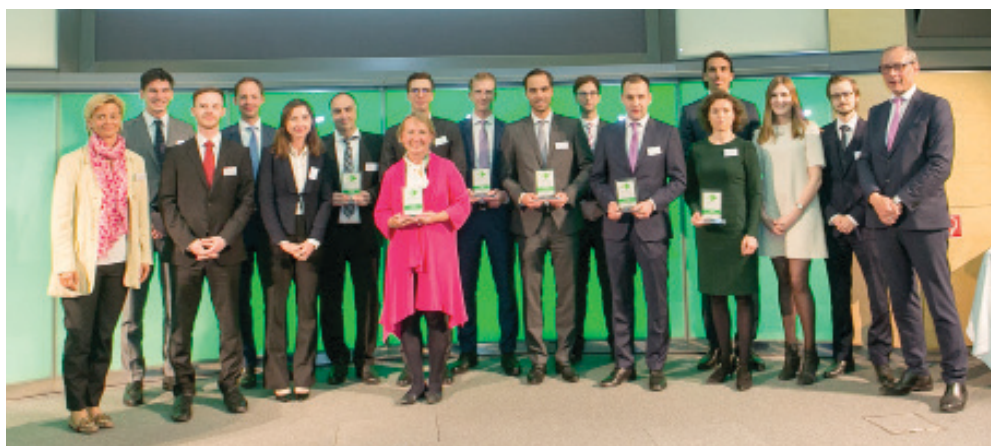
The RCB Structured Products Team

The award ceremony took place at the premises of Raiffeisen Bank International in Vienna and was hosted by Zertifikate Forum Austria (ZFA) and its partner ZertifikateJournal. The independent top-class jury with 21 experts voted: With only one exception (4th place in the category of leveraged products) Raiffeisen Centrobank remained ahead of its competitors and won every single category.