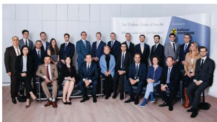
The successful „Structured Products Team“ at Raiffeisen Centrobank